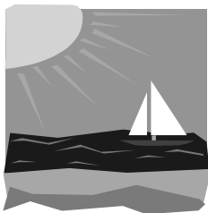
We're coming into that season when we might get both sun and wind, but then maybe not.... Summer is for boats in any weather!