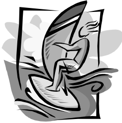
The real challenge of a race at Shilshole is dodging the windsurfers and hobie cats!