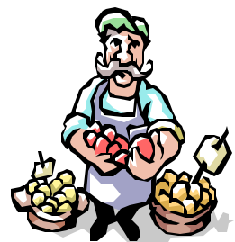
Let's see which one of these guys can juggle all those apples!