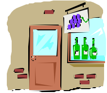
Remember, it's under the Bluwater Bistro, on the lake level.