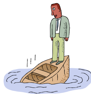
Was that a deadhead?

Send your 2006 Dues NOW to Nancy McKenzie, 11945 80th Pl. NE Kirkland, WA 98034 It’s still $29 without Mainsheet, $39 with Mainsheet Write the check to CAPS