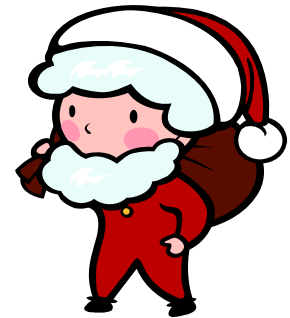
We'll take whatever we can get when it comes to Santa Claus!

But we did have fun, and there were some really nice gifts, and then there were some really awful ones, too! All in all a fine way to usher in the holiday season in a nautical way.