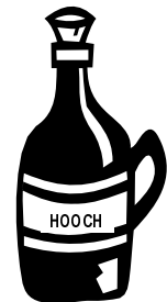
One splash for the pot, a nip for the cook, and so on, and so on.

Preheat oven to 450°. Cook sweets and mash. Add spices, butter, sugars, & salt. Beat until light and smooth. Beat egg yolks until light and add to above mixture. Stir in lemon juice, milk and bourbon. Mix well. Beat egg whites until stiff and gently fold in. Pour into unbaked pie crust and bake 10 minutes at 450°. Reduce heat to 350° and bake 25-35 minutes longer until pie is puffed up and firm.