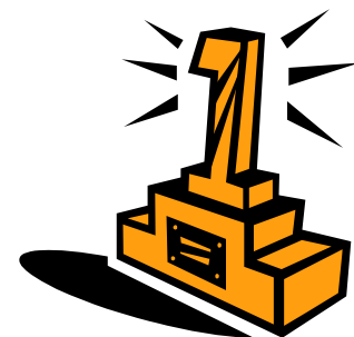
First in the hearts of their fellow sailors — sometimes first just because they had the worst luck!

So we come to the end of another grand year and another grand banquet. For those of you who couldn’t make it, you missed a fun time. And, just because you aren’t there, as was learned by at least one winner, doesn’t mean that the trophy won’t be presented, with all the flourish and innuendo that can be mustered!