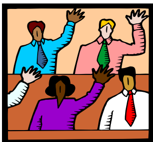
Not a bunch of yes-men and women in this group!

Some even saw the fireworks! Happy New Year!