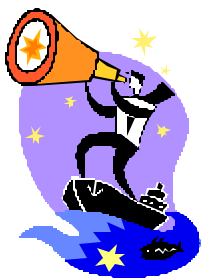
Cap'n Bob is steering in the dark, as usual! Found himself a shrimp boat, though.

Now Our dear Commodore Is rambling on Back roads Near the Dismal Swamp!