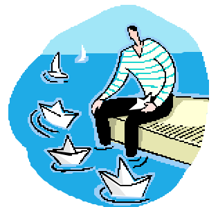
A cruise is any collection of boats at a dock that seem to have something in common, or seem to be having more fun than everyone else!

Send your 2006 Dues NOW to Nancy McKenzie, 11945 80th Pl. NE Kirkland, WA 98034 It's still $29 without Mainsheet, $39 with Mainsheet Write the check to CAPS