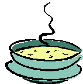
Don't burn your tongue! So easy and so good.

It was delicious — on anything — bread, crackers, fingers!