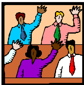
Can this many officers need to use the head at the same time?

Our cruising and racing season had already started and Good Tide’ngs II missed the start of both. We look forward to a strong finish and fun season with all the CAPS members.