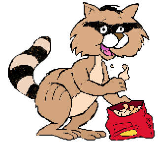
This seems to be the primary off-season inhabitant of Blake Island. Wonder how it does when there are tourists?