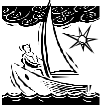
Bob loves to place in a race — even when it's last over the line!