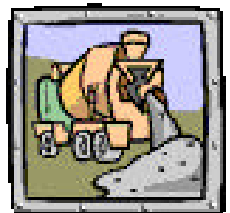
Does anyone know what's going on at Shilshole? And they have the nerve to raise the cost of moorage before they're even finished!

Have you Looked at Our Web Site www.capsfleet.com Lately? Our webmaster, Dave Fend, Is only juggling More than a dozen Of them But it's always Updated Immediately!