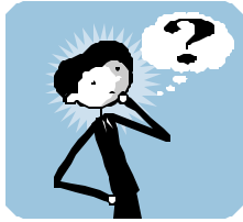
What will these guys think of next?