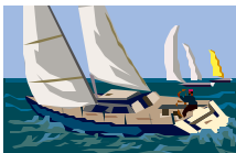
Getting there can be half the fun!

boat on the other finger pier had all his out, too. Hers were squished against the dock and his were mashed between the two boats — at least he left later that afternoon and the smaller power boat that took his place fit — but he did have to borrow a "rope" to spring his boat so the swim step could be used for