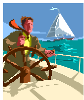
Who cares if you're supposed to be a work? You've got better things to do!

Changes for this calendar will show up on the Web At www.capsfleet1.com