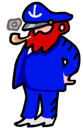
Just because a guy thinks he is a boater, doesn't mean he is a nice boater!

At least we have a target to shoot for next year, or a dockmaster to shoot and some boats to sink!