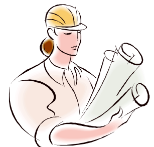
Oh, do we have plans for you!