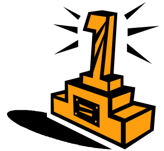
Sometimes it's questionable if anyone has "won" something!

So now we move on to 2007. Remember, members, take copious notes during others' mishaps. Someone will deserve to receive one of these accolades, and it only takes you to tell it as it is.