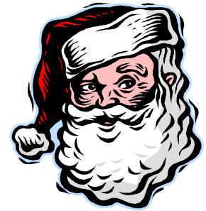
Santa always makes our parties better!